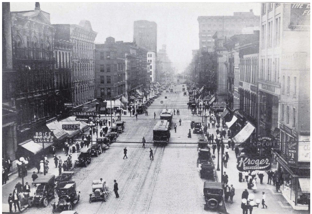
Downtown Columbus circa 1915.

Turkey and trimmings were on the menu for BX members from 1944 to 2004, after which the annual meeting dinner was replaced by an extended social time to facilitate networking. But the raffle continues, and the remaining turkeys that are not claimed are donated to charity.