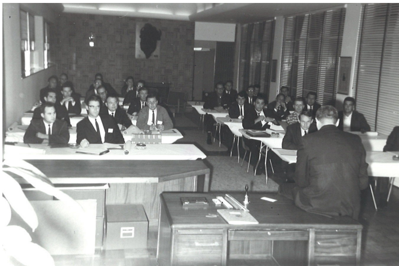
The first education program developed and taught by a team of BX members in 1966 – a 13-week estimating course – has been a regular part of Exchange offerings for more than 50 years.

As the Builders Exchange of Central Ohio marks its 125th anniversary during 2017, it is reviewing the history of its most valued services, including its unique education programs. Not only are many BX courses crafted and taught by member experts – they were, and continue to be, attended by competitors across the industry.