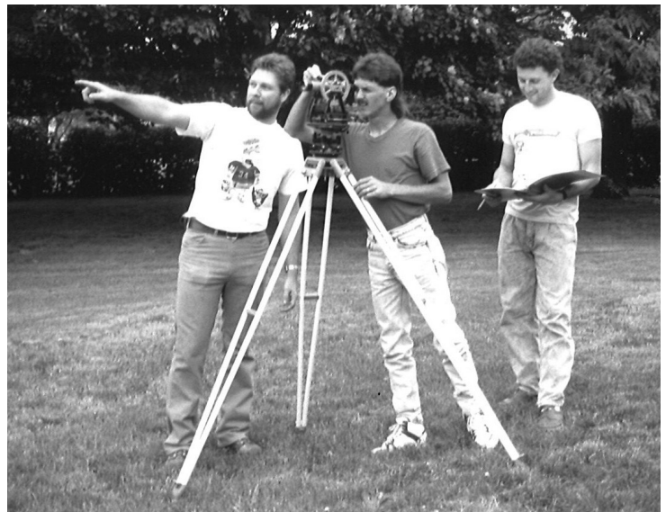
The “Construction Layout & Basic Surveying Skills” course works in the BX backyard circa 1990. The first surveying class was launched in 1967 and is another half-century BX education staple.

Business was changing quickly and BX seminar topics reflected that. In 1980, the Exchange offered a day-long seminar, “A Comprehensive Review of Computers and Their Use in the Industry.” Touching on the services “rendered by a computer,” the class introduced BX members to accounting systems, design applications, inventory uses, word processing and construction applications like critical path, PERT and estimating. It was the first of many education programs about technology!