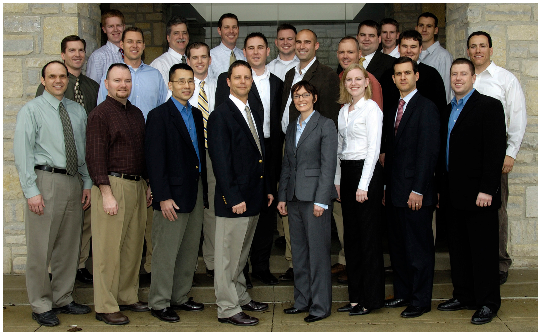
The inaugural class of the Rising Leaders Institute in 2007.

Topics were built around “soft skills” needed by young managers: coaching your team, communicating effectively, negotiating difficult situations. It was different from the traditional “BX formula” and was an instant success. The inaugural Class of 2007 sold out quickly, and it continues to be in high demand.